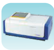
UV/VIS Spectro 2080+ Double Beam