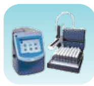
Total Organic Carbon 3800