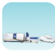
Laser Particle Size Analyzer